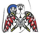
First Nations Health Council